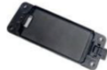
Magnetic Mount (Optional)